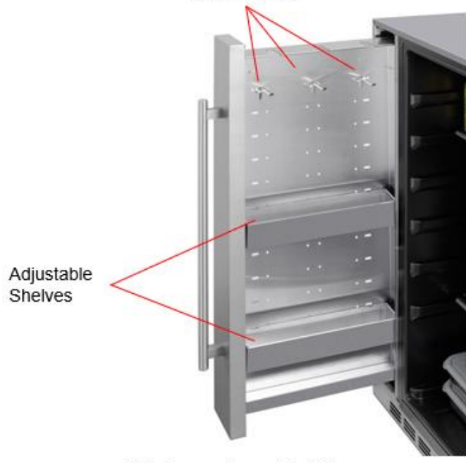
Side Compartment Detail